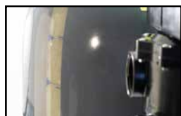
Marked transparent window showing sand level.