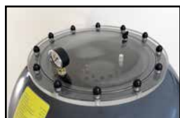
A Ø400 lid in reinforced PP for all models (available also in non-transparent version)