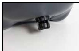
A larger filter drain of 1¼ for faster emptying